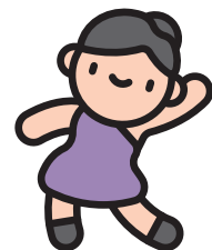
Dancing and drama