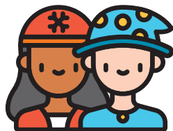
Dressing up and imaginative play