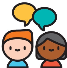
Talking and listening