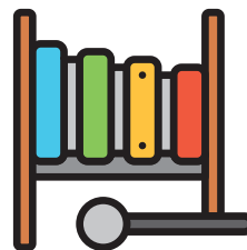
Singing, listening to and playing music