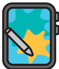
Using digital technologies