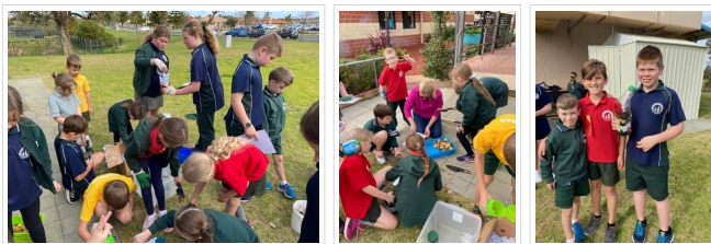
Week 3 – Using compost to ready garden beds for the next planting session