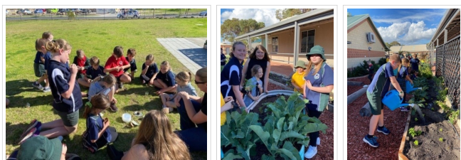
Week 2 – Making mini compost bins, learning why we compost and how to compost and decorating a crunch n sip compost collection container